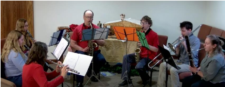
Instrumentalists enhance the Christmas Day service.